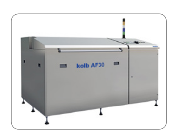
kolb AF30 AirFlow® systems

A closed rinsing circuit is integrated into all kolb cleaning systems. Usually these are systems for product (PCBs, DCBs, HDIs, etc.) or for tool cleaning (screens, stencils, solder frames / carriers, condensate filters, etc.). The rinsing water is repeatedly used in the ClosedLoop process (depending on the cycle number and the task options) until its dirt entry respectively its \mu S conductance is so high that it is no longer usable and has to be disposed. The cheapest disposal is the indirect introduction into the public sewage network. This may only be done with regard to the legal limit values! The operator is responsible for compliance with the local regulations, possible authorizations by the authorities and proper operation.