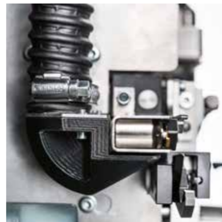
Optional suction unit for stripping remnants