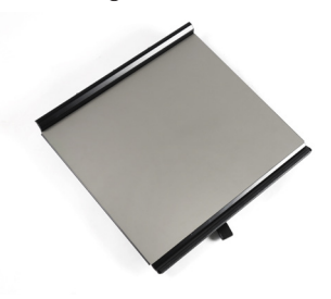
XY table part no: 95 50001

You can also combine the system with our excellent XY table which allows you to precision control of the object you are working with. You can also use it with our Cmore tilt table which allows you to see the object in different angels.