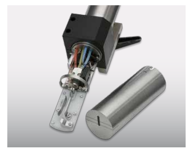
Marking head With magnetic jet locking system