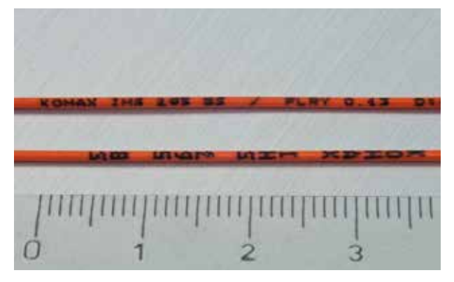
Marking sample Printed with ims 295 BS, 0.13mm<sup>2</sup> cable (AWG26)