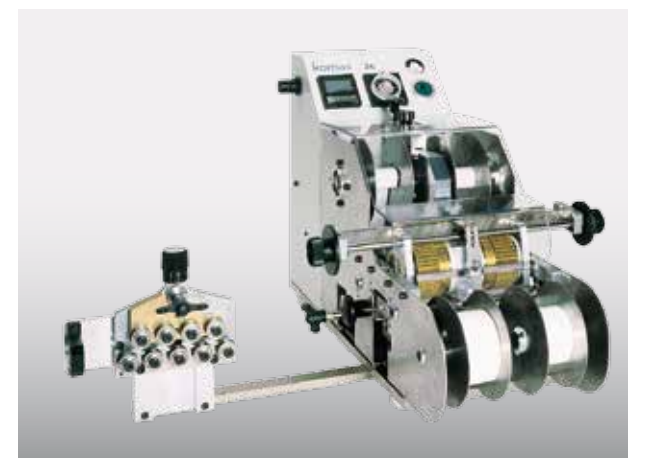
▲ Komax 26 Hot stamp marker with straightening station

And the simple communication system allows the Komax 26 to be connected to all common wire processing machines.