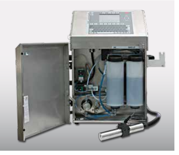
A Ink system Neat and reliable

Other default settings are normal and bold font, font height and width, double spacing, inverse font and automatic adjustment of the center line to the cable diameter. This centering is provided for use with automatic cable change (Zeta-machines).