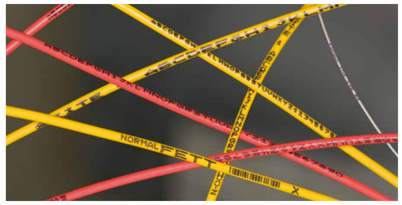
▲ Marking samples Done on the ims 295 BC and ims 295 BS

The ink system meters out just the amount of solvent required and constantly measures ink density to ensure economical and ecological operation. An optional solvent recovery system additionally minimizes solvent use and emissions.