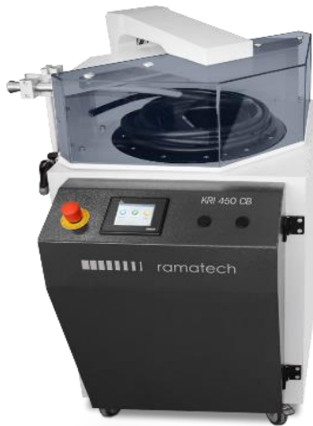
KRI 450 C