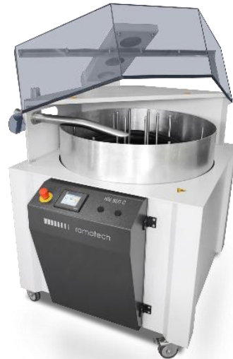
KRI 850 C