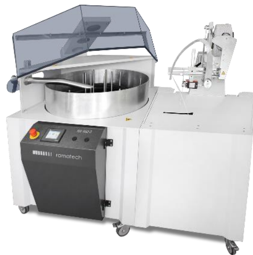
KRI 850 CB