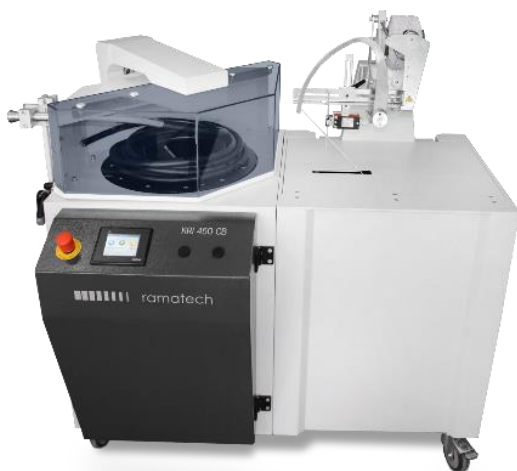
KRI 450 CB