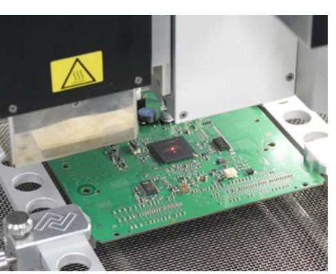
Laser marking of the targeted position

Special attention was placed on the automation