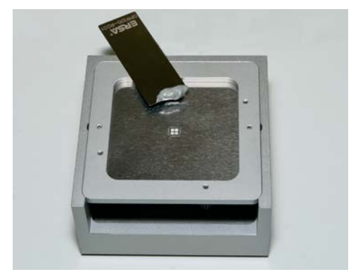
Dip & Print Station with "MLF32" stencil

282 912 - 042015 | subject to change | © Ersa GmbH